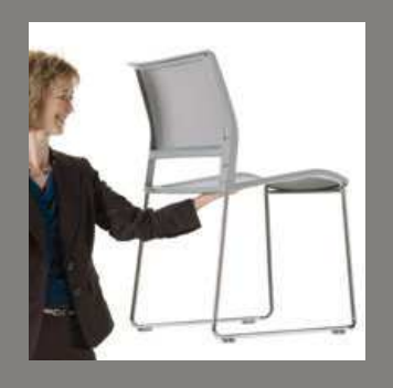
EASY-LIFT, MOVE, STACK Opt4 responds to the need for an easy-to-carry, easy-to-stack, and easy-to-move chair and stool. The mesh/mesh high-density chair weighs a mere 7.3 pounds - the lightest high-density stack chair available.